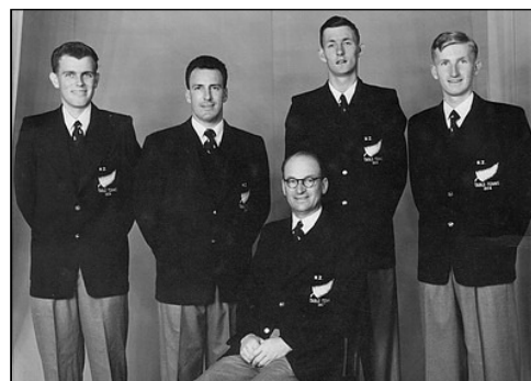
(Above): NZ Team to World Championships England 1954

Men's Singles - 1960, 65 Men's Doubles - 1959, 60, 61, 66 Mixed Doubles - 1959, 65, 66 Under 18 Boys' Singles - 1952