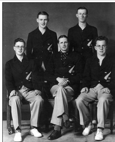
(Above): NZ Team Australian Tour 1939