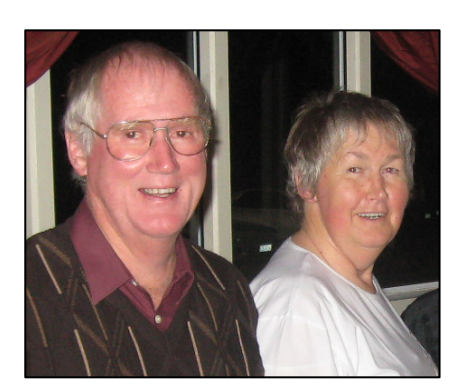
With wife Ngaire in 2009 Veterans & TTNZ 75<sup>th</sup> Dinner in Christchurch

Open Mixed Doubles - 2006 Over 40 Mixed Doubles - 2000 Over 45 Mixed Doubles - 1992 Over 50 Men's Singles - 2005 Over 50 Men's Doubles - 2005 Over 50 Mixed Doubles - 1994, 95, 96, 99, 2006 Over 60 Men's Singles - 2005, 06, 07, 09 Over 60 Men's Doubles - 2005, 11 Over 60 Mixed Doubles - 2005, 07, 09, 13 Over 65 men's Singles - 2009, 11 Over 65 Men's Doubles - 2009, 10