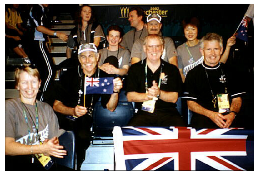
2002 Commonwealth Games Celebration

2003 Australian Veterans Championships 2006 Australian Veterans Championships 2006 Veterans Test Match v Australia 2007 Australian Veterans Championships 2010 Veterans Test Match v Australia 2011 Veterans Test Match v Australia 2012 Veterans Test Match v Australia