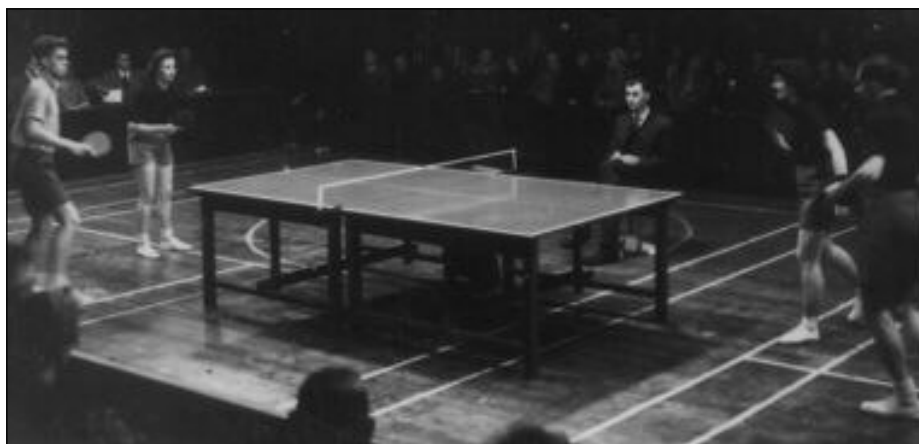
(Above) 1953 NZ Championships Mixed Doubles Final

Women's Singles - 1949, 50, 51, 52, 53, 54, 57 Women's Doubles - 1949, 50, 51, 54, 55, 57 Mixed Doubles - 1950, 51, 52, 53, 54, 55, 57 Under 18 Girls' Singles - 1947