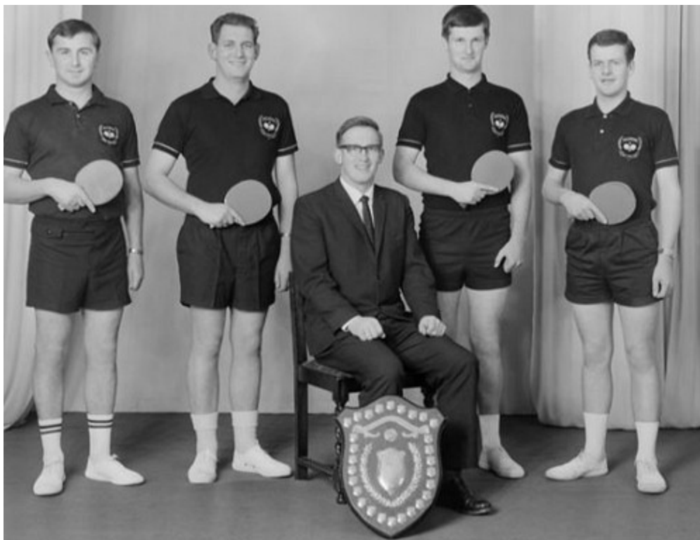
1967 Wellington Men's team to NZ Championships

The 1967 Wellington Men's Team won the Kean Shield (Inter Association Men's A Grade Teams) at the New Zealand Championships held in Wanganui.