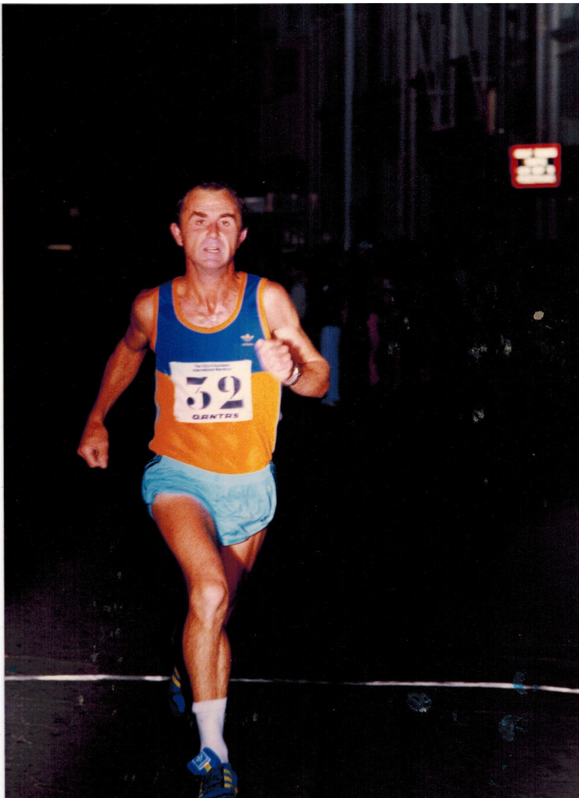
Running in the 1980 Auckland marathon