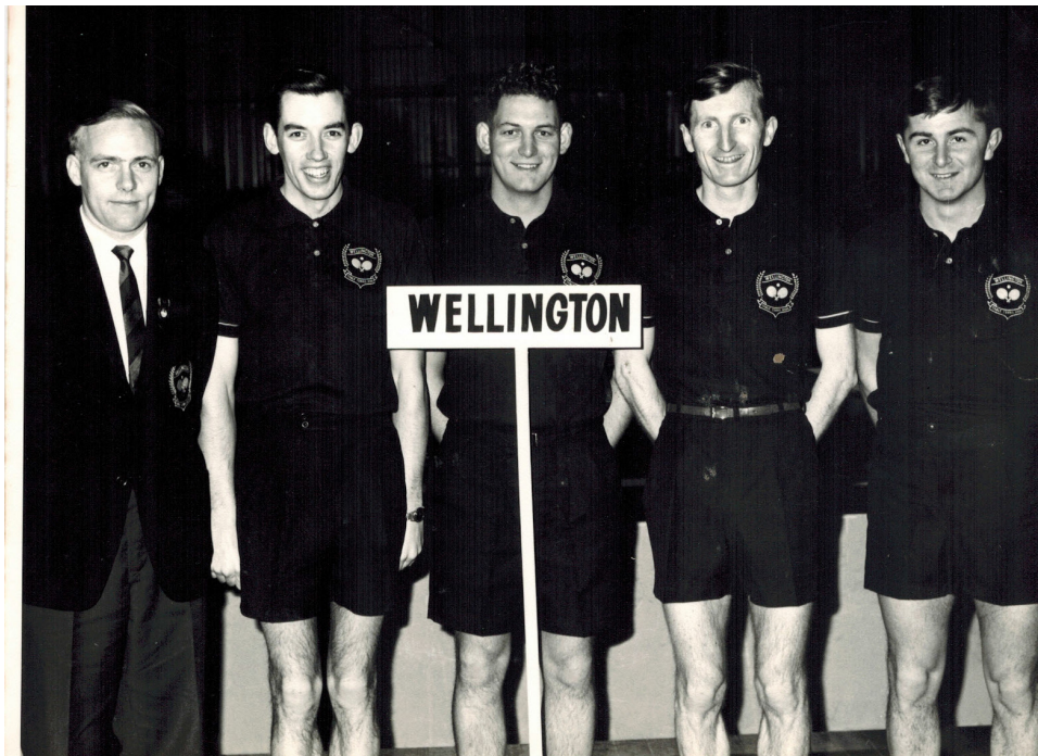
1964 Wellington Men's Team to NZ Championships. Kean Shield winners.