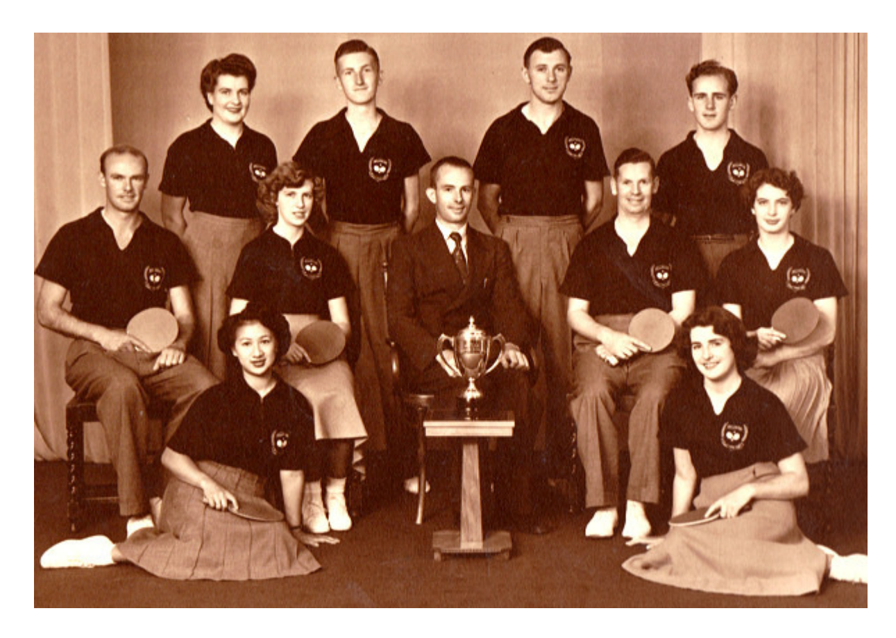
1951 Wellington Men's and Women's Teams.

Information in this article came from the Dominion Newspaper, The Salient (Victoria University of Wellington Student Newspaper), Wellington Table Tennis Annual Reports, New Zealand Table Tennis Annual Reports, TTNZ Chronicles, TTNZ Photo Archives, Wellington Tennis Annual Reports, Tennis Archives, Island Bay Tennis Club, The Alexander Turnbull Library and The National Library.