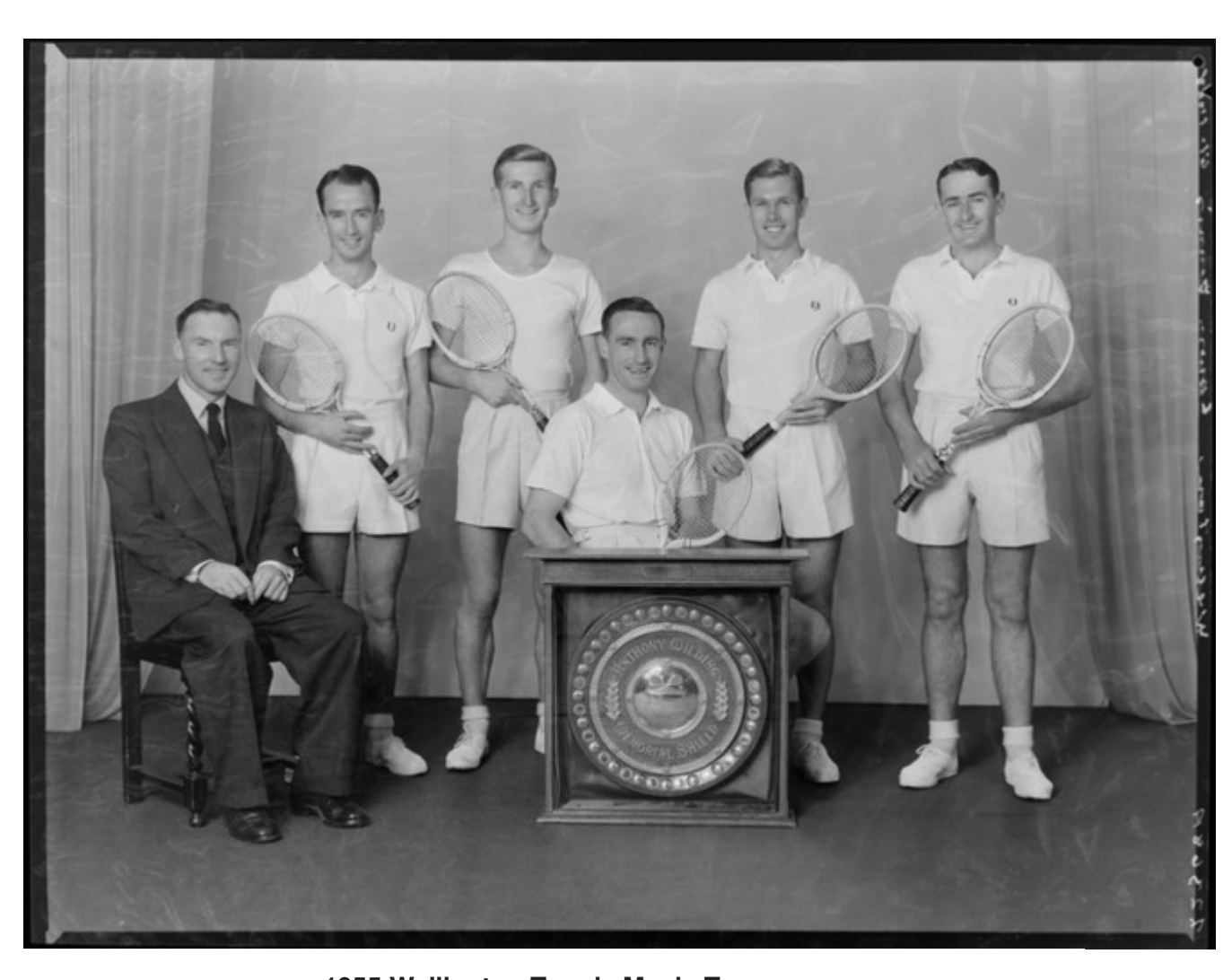
1955 Wellington Tennis Men's Team.