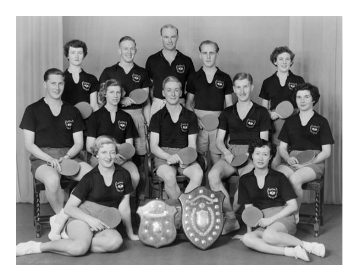
1954 Wellington Table Tennis Men's and Women's Teams.

Winners of the NZ Interprovincial Men's and Women's Teams Tournament.