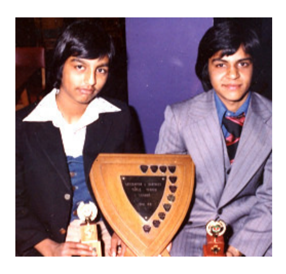
Above: Leicester and District Table Tennis League Division 15 Champions (1976)