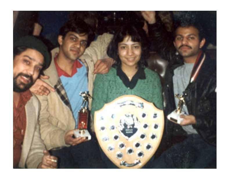
Above: Leicester Polytechnic – Overall National Asian Students Sports Champions (1981)