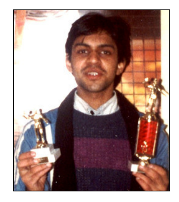
Above: National Asian Student Table Tennis Singles and Doubles Champion (1981)