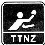
Table Tennis New Zealand - YOUR sports body PO Box 867, Wellington

Ph: (04) 801-4160 Fax: (04) 471-2152 E-mail: ttnz@clear.net.nz