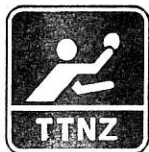
Table Tennis New Zealand - YOUR sports body