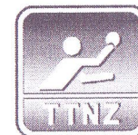
Table Tennis New Zealand