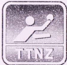
Table Tennis New Zealand