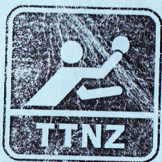
Table Tennis New Zealand