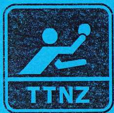
Table Tennis New Zealand