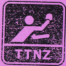
Table Tennis New Zealand