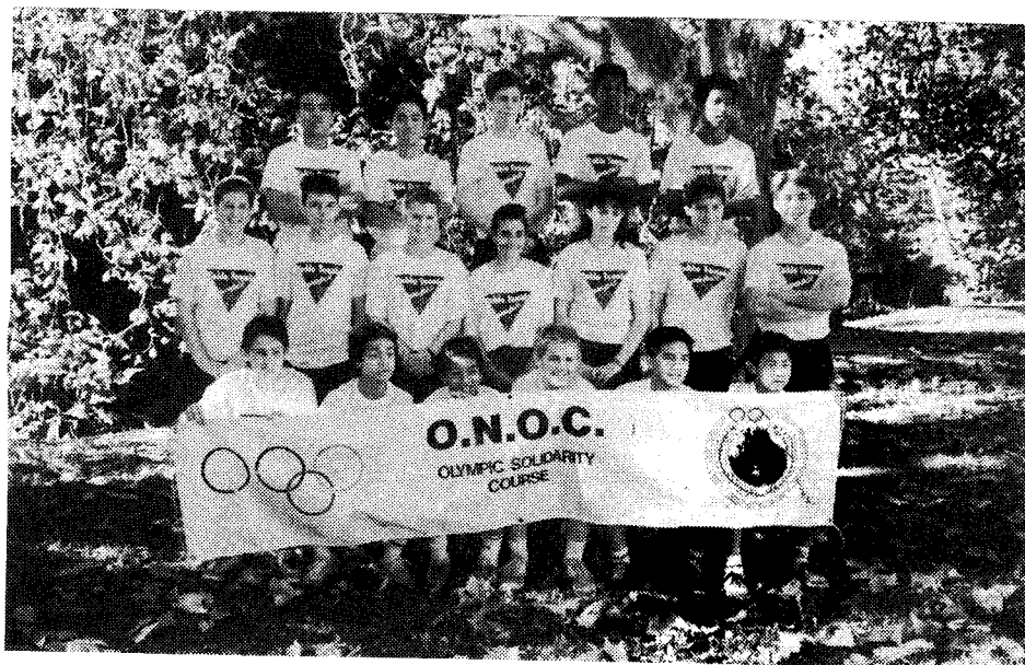
The Players (above) Coaches and Staff (below)