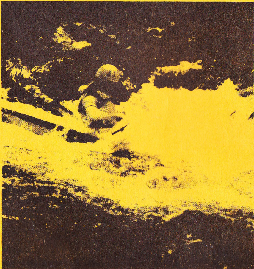
Shell continues its support of youth groups, including the Outward Bound School at Anakiwa.

Business must achieve its economic objectives in order to survive and to grow: but its survival is dependent on its acceptability to society and its environment. Shell, recognising its responsibilities as a corporate citizen within the community,