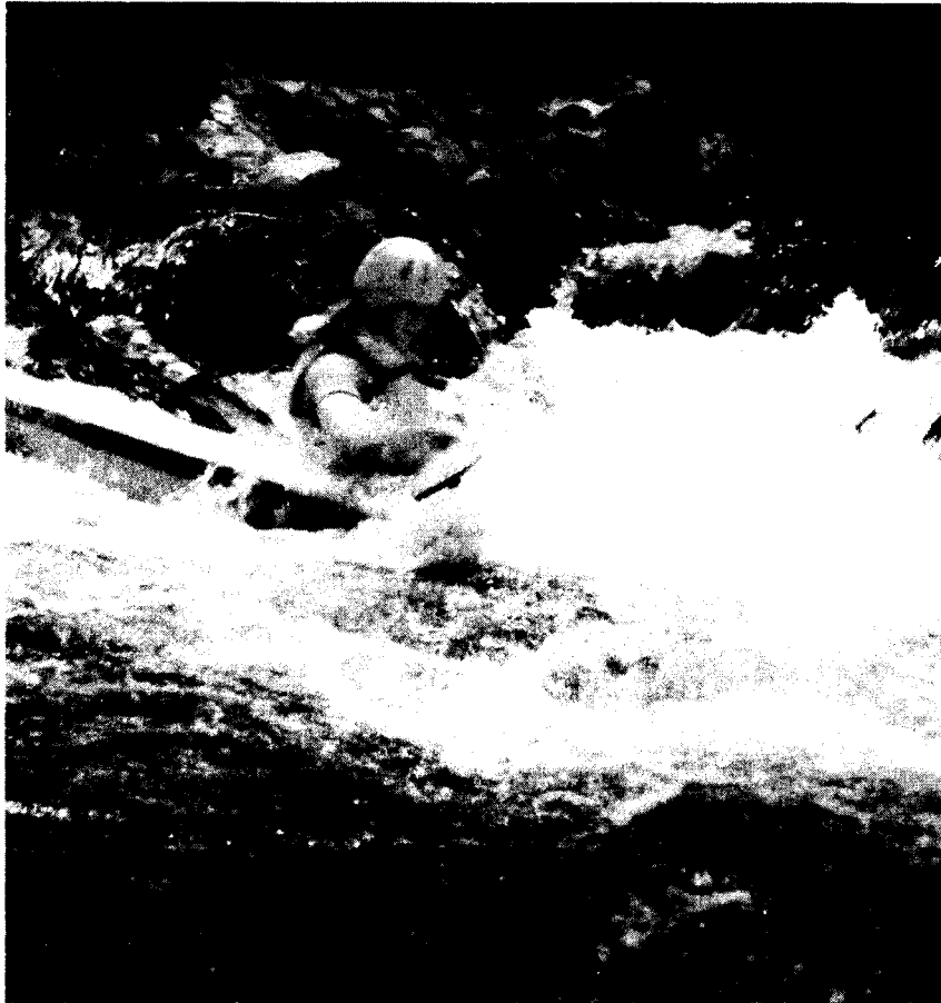
Shell continues its support of youth groups, including the Outward Bound School at Anakiwa.

Business must achieve its economic objectives in order to survive and to grow; but its survival is dependent on its acceptability to society and its environment.